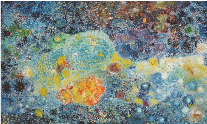
Chaos in the Cosmos , oil on canvas