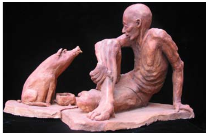
The Prodigal Son and a pig , fired clay, 10" x 10", 2007